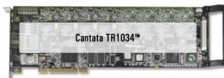
Cantata TR1034™ (315mm x 107mm)

Delivering more board features in less space the IQ Express™ is 180mm in length and requires 50% less real estate than traditional fax hardware options.