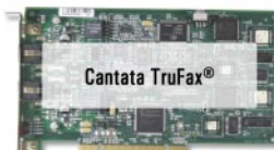
Cantata TruFax® (190mm x 107mm)